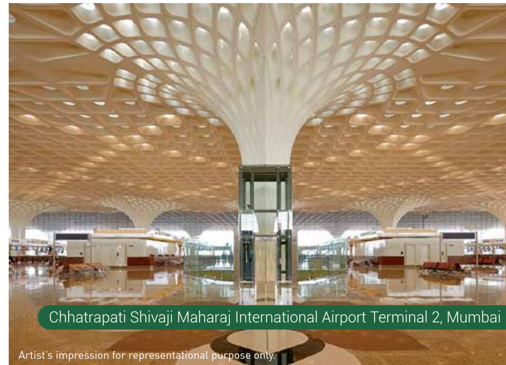
Chhatrapati Shivaji Maharaj International Airport Terminal 2, Mumbai

Artist's impression for representational purpose only.