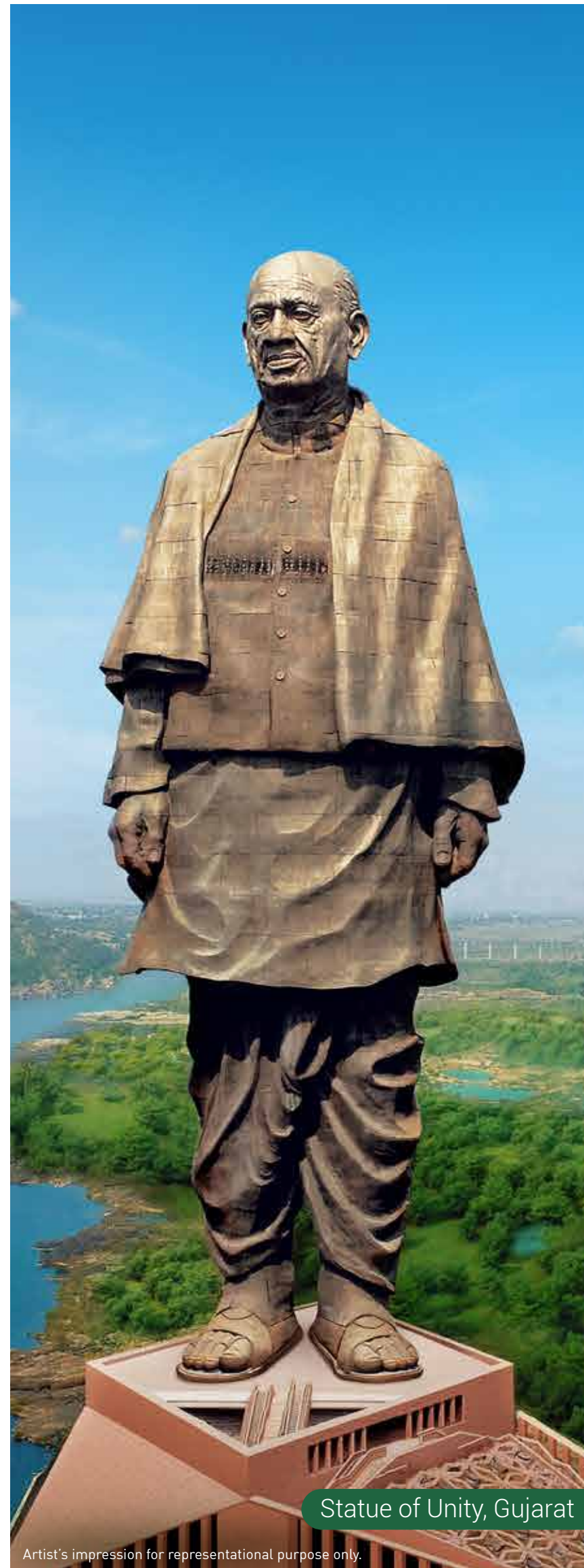
Statue of Unity, Gujarat

Artist's impression for representational purpose only.